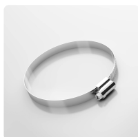
Hose Clamp with Worm-Gear, Steel quality W4, stainless steel 1.4301 Standard clamp for fastening light hose types to connecting pieces on mobile and stationary installations