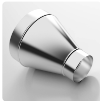
Hose Reducer, symmetrical Hose reducer for extending, connecting and joining light to medium weight hoses