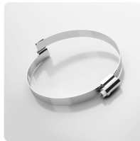
Master-Grip Hose Clamp, screwable Special clamp for fastening light and medium-weight, right-handed spiral hoses such as Flamex B-se, Flamex B-F se, Master-PUR Trivolution, Master-PVC and Master-SANTO