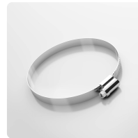
Hose Clamp with Worm-Gear, Steel quality W4, stainless steel 1.4301 Standard clamp for fastening light hose types to connecting pieces on mobile and stationary installations