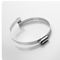
Clip-Grip Hose Clamp, screwable Screwable clamp for attaching all hose types from the Master-Clip series to mobile and stationary systems